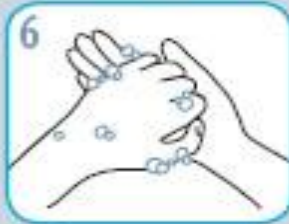
6 Rub fingertips of each hand in opposite palm.