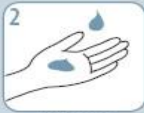
2 Apply soap.