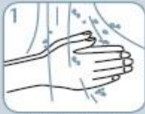
1 Wet hands with warm water.