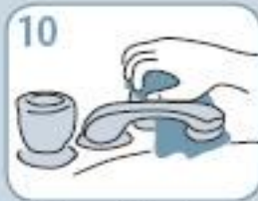
10 Turn off water using paper towel.