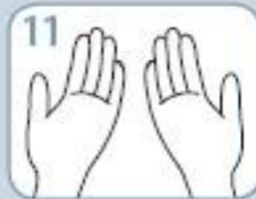
11 Your hands are now safe.