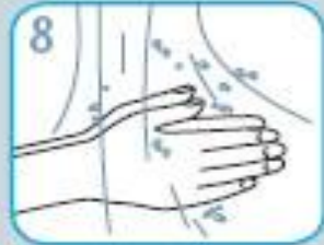
8 Rinse thoroughly under running water.