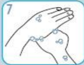
7 Rub each thumb clasped in opposite hand.