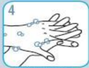
4 Rub in between and around fingers.