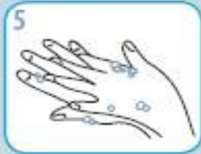
5 Rub back of each hand with palm of other hand.